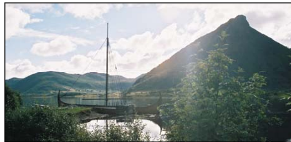
Replica of the Gokstad long-ship at Borg

Archaeological excavations revealed remains of a longhouse, 83 m in length, and scholars established the fact that this was the largest building ever found in the Viking world. A modern reconstruction was built close to the original location. The museum focuses upon experimental archaeology and traditional handcraft, as well as being a "living museum."