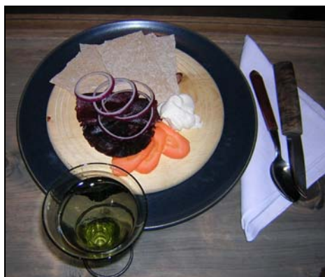
Traditional food is served Lofotr Vikingmuseum

The Vikingmuseum is situated in the middle of the Lofoten islands, an area with a strong traditional coastal culture. The ocean connects all the islands together and has been the main communication way as well as an important source of nourishment. The art of boat building in Norway is probably as ancient as the first settlers.