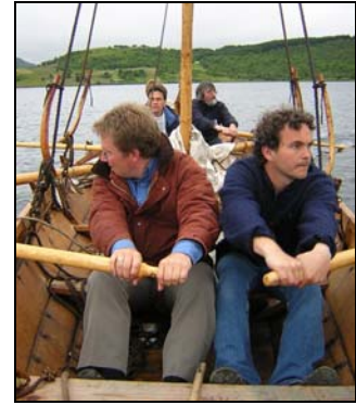
Rowing the Viking long-ship.

Through the Norce project we will focus upon coastal culture by making the ships suitable for adventure tourism. Also the sail-making process will be demonstrated at the museum through the weaving of a "sail-reconstruction". Food and plants in the coastal area will also be a theme with traditional herbs and plants in the area and the use of these to develop our menus.