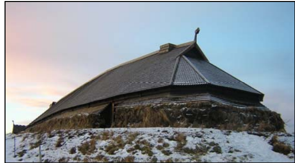
The reconstructed chieftain's longhouse at Borg

Lofotr, the Viking-museum is a site-museum , today represented by a reconstruction of a chieftain's long-house, a black-smiths house, a boathouse as well as reconstructed Viking-ships. The origin of the museum was in 1981 when a local farmer discovered pieces of glass and potsherds in the plough-furrows. These artefacts turned out to be French and German imported ware, 1000 years old and for the first time to be found so far north. Surveys and excavations started and the results threw an entirely new light on the relationship between Lofoten, Southern Scandinavia and the rest of Europe during the Iron Age.