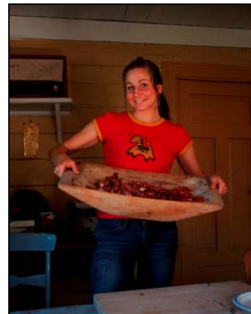
Traditional food of North Troms

In the food project have we made a new menu for use in the museum. Together with local tourist operators have we of the needs for serving in our business. We have together with local producers started too develop new menus and products grounded on traditional recipes.