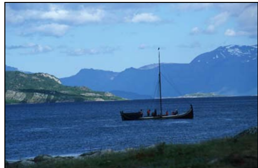
Traditional Sámi boat

In line with the eco-museum concept, the museum does not consist of one single building with exhibitions. Since 1978 the museum has restored more than 90 buildings, of which 30 now is open to the public. Amongst these buildings is one farmstead in each of the municipalities and each farm shows different aspects of the culture of Northern Troms, from fisher-farmer subsistence, to Saami and Kven way of life, from rich to poor.