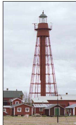
The lighthouse of Pite-Rönnskär

At Gåsören in the inlet to the town of Skellefteå a lighthouse was built in 1881. This lighthouse is now under the protection of law.